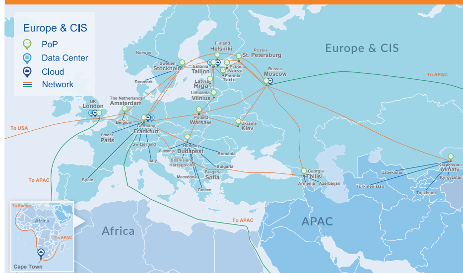
The diagram above shows the European network

CITIC Telecom CPC is an expert to deliver ICT services across the globe, including Europe & CIS, US, Africa, APAC and the Greater China.